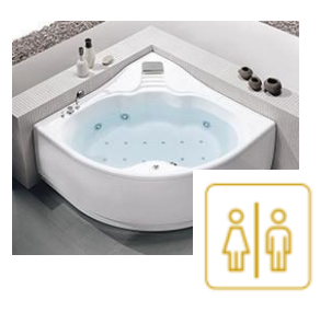
MEDICAL & HYDROMASSAGE