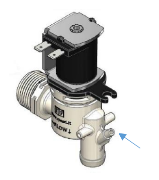
800DV Series - 3/4" Male Thread

Each of these two versions are available with a VENT to help drain the water from the line, allowing it to maintain a cleaner system.