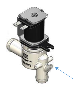
800DV Series - Hose Tail 18mm

Agency Approvals:, MOCA/FCM, NSF, WRAS, KTW, UL, ENEC